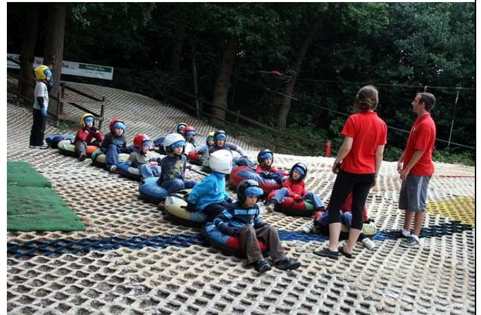
Sledging at Sandown - July 2010

Events and visits: Ringos at Sandown, Pirate Sleepover, Christmas Tree Lighting Up Parade, Beaver Xmas sleepover at the Scout Hall, District Fun Day. Talk on 'Habitat for Humanity'.