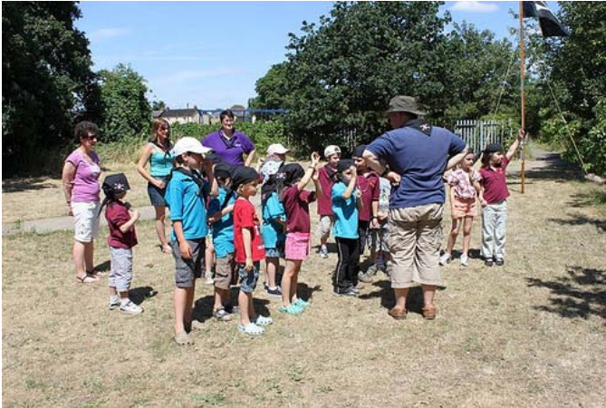
Pirate Sleepover at HQ – July 2010

Themes based on: Outdoor Challenge Badge, Air Badge, Safety and Creative Activity Badges, games, making chocolate spiders, Quiz Night, Noisy Night making drums, making straw bridges and 'papier mache' bowls. Some beavers have also completed the Chief Scout Bronze Award.