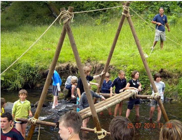
Summer camp in the Peak District – July 2010

Competitions: Superscout competition, NPL water rocket competition, Day Prowl, Kingston's District Rifle Competition, National Scout Air Rifle Championships at Bisley (with the Group's best ever results), District Swimming Gala, District Volleyball Tournament, NSRA YPS Course, Richmond District Rifle Competition, County Night Hike.