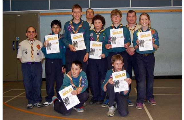
Chief Scout Gold Award – May 2010