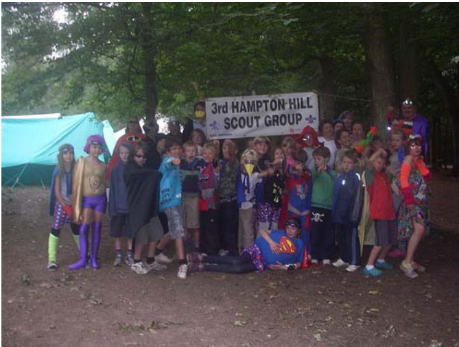
Super Heroes at Summer Camp – August 2010